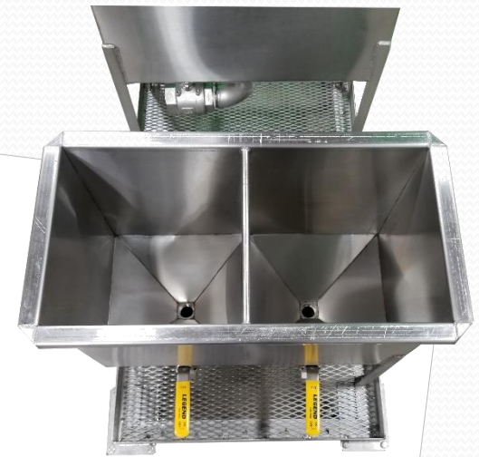
Inside view of “chemical container”